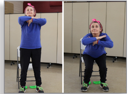
Wide Leg Squat