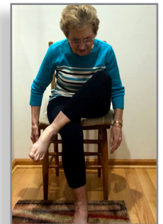
Seated Figure 4