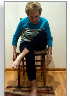
Seated Figure 4