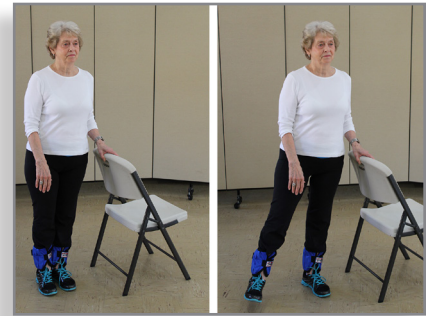
Side Hip Raise