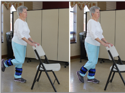
Standing Leg Curl